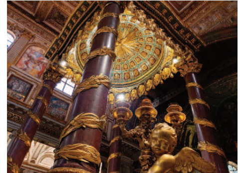
St Mary Major Basilica