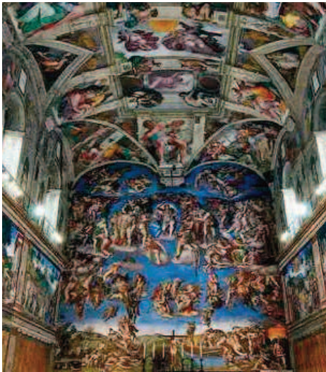
The Sistine Chapel

Today we explore ancient and baroque Rome. We visit the Pantheon , the imposing 2nd-century structure that once was pagan temple and since 609 AD is a Catholic church, make a photo stop outside the Colosseum and survey the Roman Forum . We visit the Trevi Fountain , Piazza Navona and the Spanish Steps , among other great sights. Today we have some time for shopping therapy! Overnight: Rome