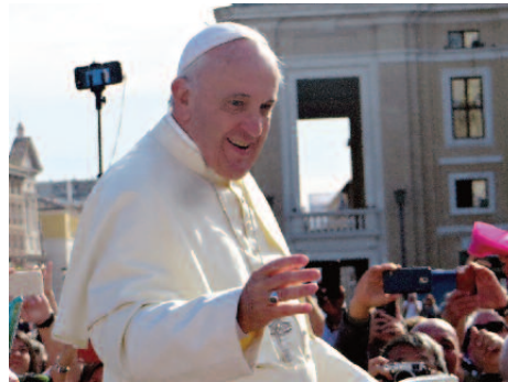
General audience in the Vatican