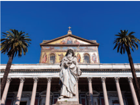
St Paul Outside the Walls Basilica

Places on this pilgrimage are limited, so to avoid disappointment, BOOK EARLY by putting down a deposit (see page 4).