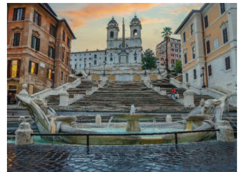
The Spanish Steps