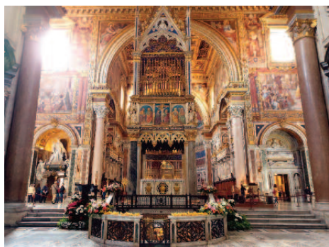
St John Lateran Basilica