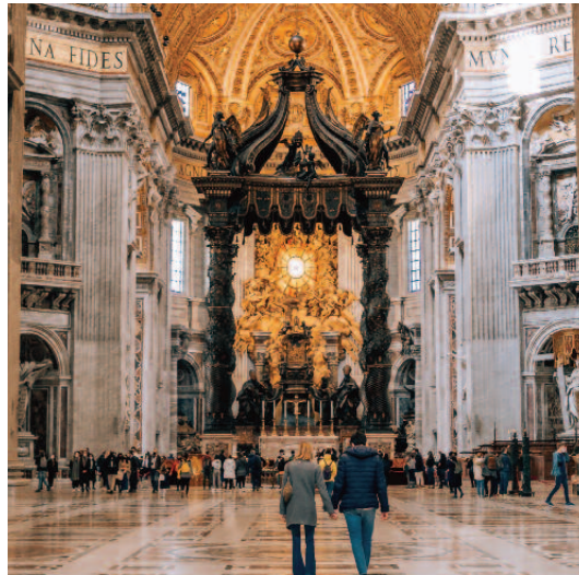
Interior of St Peter's Basilica