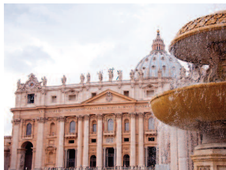
St Peter's Basilica