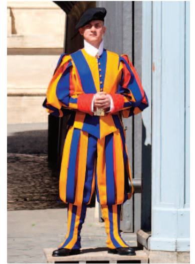
Swiss Guard on St Peter's Square